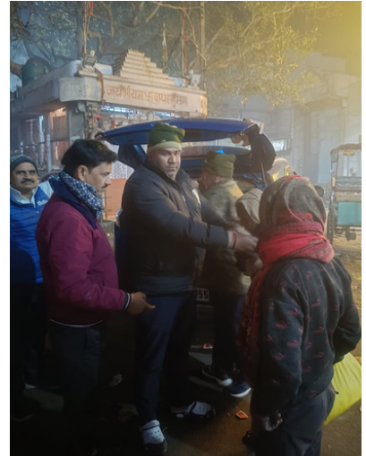
Winter clothes distribution by TOS Sanatan Noida Group at Agra in Jan 2026.