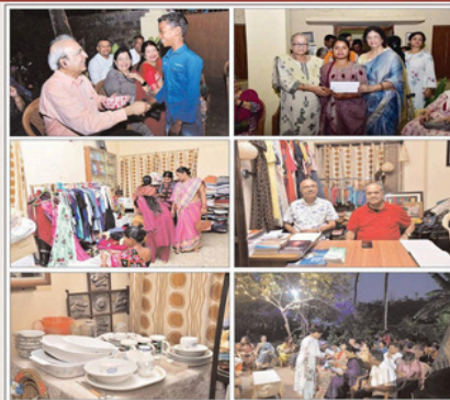
Crockery, cutlery and decorative pieces." And all these at throwaway prices ensuring accessibility without compromising self-respect, she said. However, spiritual, moral and educative books are available free of